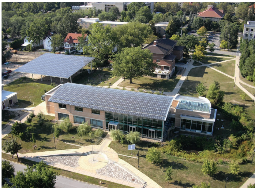
The AJ Lewis Building at Oberlin College.